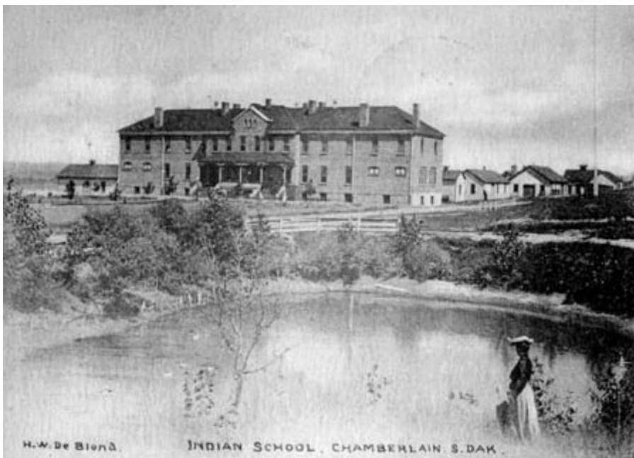
St. Joseph's Indian School was a newer founded boarding school that began in 1927. St. Joseph's still operates as a fully-functional Lakota boarding school, however, now instead of dormitories, they use a family /home environment with 12 children per their 19 campus homes. Chamberlain, SD